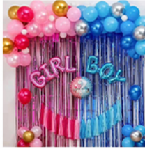
• Baby shower