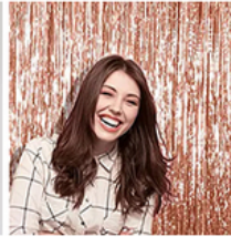
• Photography backdrop