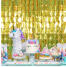
• Happy birthday