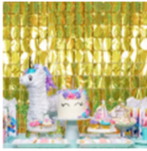
• Happy birthday