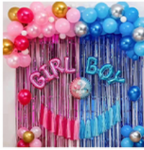
• Baby shower