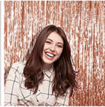
• Photography backdrop